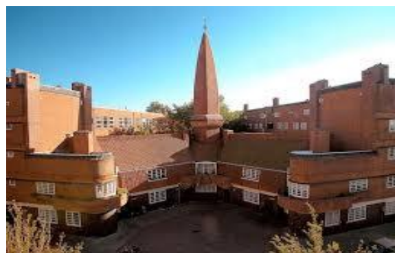
„Het Schip“, social housing for 102 families in the heart of Amsterdam

June 13-21, the International Social housing festival is held in Amsterdam. 5 The city of Amsterdam, the Dutch housing corporations, universities and NGOs, including the Dutch Woonbond and the tenants' association of Amsterdam, will present a varied programme, which is grouped around the museum 'Het Schip', a famous social housing complex in the architectural style of the Amsterdam school.