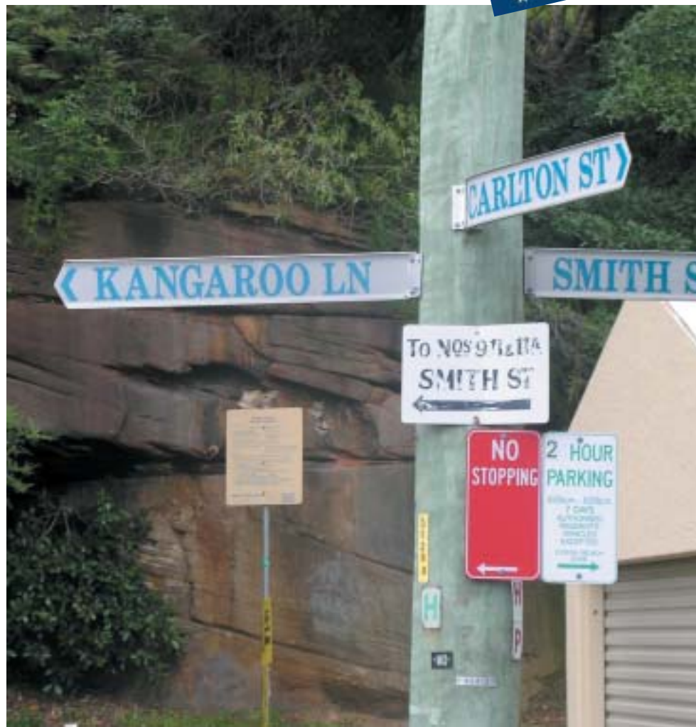
New roads for Australian housing policies?

Rent assistance in Australia had its origins in 'supplementary assistance' which was introduced in 1958, but with very limited eligibility, mainly widows and single aged pensioners. In 1963 there were only 9,518 recipients of rent assistance. At the time, this approach was seen as a cheaper option than a more general pension increase. The scheme remained in place until 1983 when the newly elected Labour government expanded it to include almost all social security pensioners and other beneficiaries, as well as making it an entitlement rather than a discretionary scheme. Rental assistance is not designed to reduce rental outlays to some benchmark – for example, 25 per cent of income – but simply to improve rental affordability for social security recipients.