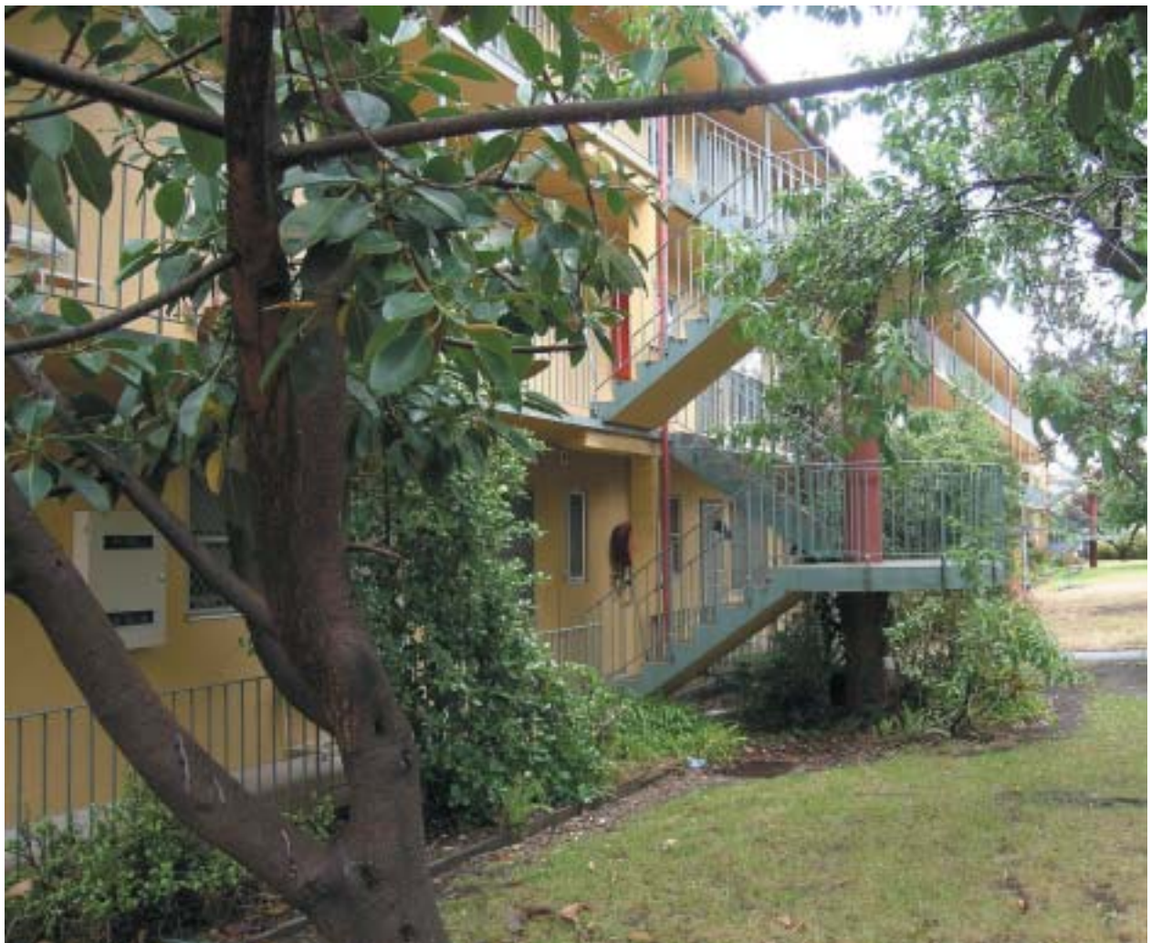
Public governmental housing in Melbourne

ement housing to serve a poor manufacturing working class. The typical working-class housing in nineteenth century cities was single or two storied terrace housing, while middle-class - and a growing proportion of affluent working-class - housing was single detached and remained so into the twentieth century. In 1933, for example, only 4.8 percent of the national stock was apartments or flats. This has important implications for the nature of Australian private rental. The entry costs for investment in a single cottage are very different to those of a block of tenements in New York or Glasgow or apartments in London, Paris, Stockholm, or Berlin. The former meant that investment was possible by people of relatively modest means where the latter meant you had to be rich or a company investor. ►