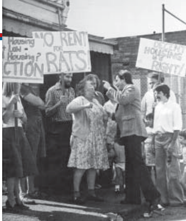
Strong sentiments in the Royal Court dispute, in 1972.

The promotion of tenants' right in Victoria was given considerable impetus by linking it with broader consumer rights movement. By the mid 1970s, consumer rights had gained acceptance in public policy, and positioning tenants as consumers made supporting basic protections for them much easier.