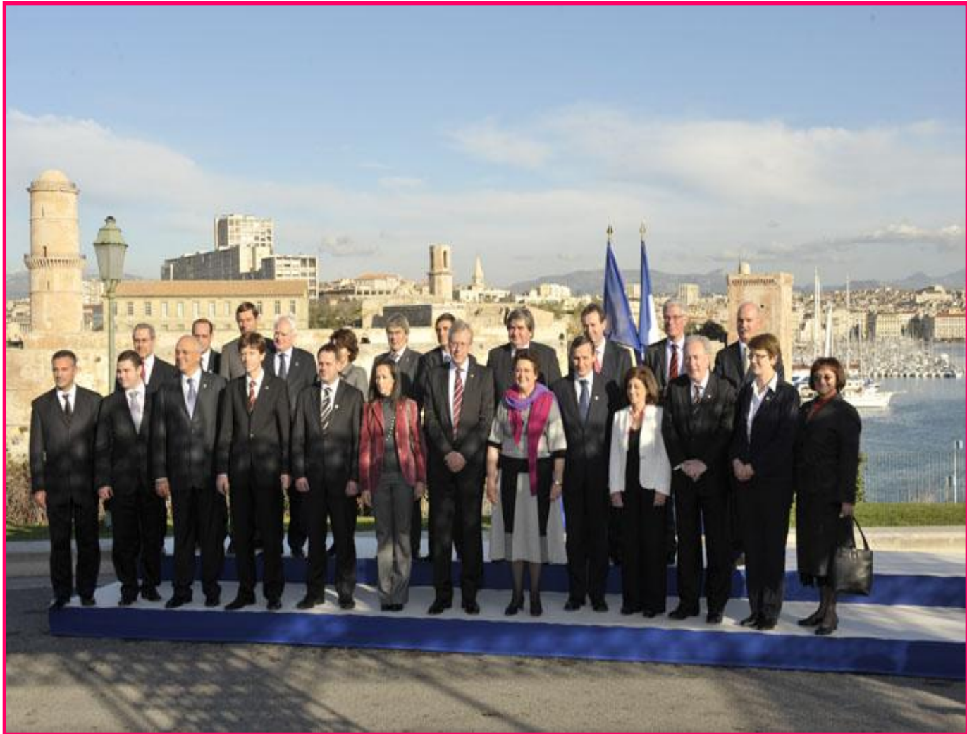
EU housing Minister's meeting, Marseille, 23 November 2008