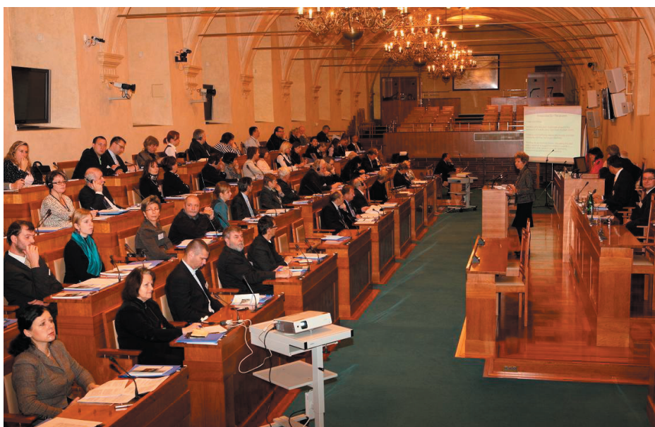
The conference "Cities of the Future" was organised by MEP Oldřich Vlasák (Czech Republic, ECR) (picture on the right) in the Senate Chamber of the Czech Parliament in Prague.

(More information on the conference: www.smocr.cz/cz/obce-a-evropa/prilis-se-soustredime-na-minulost-dulezitejsi-je-ale-budoucnost.aspx )