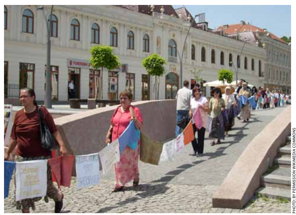
Peaceful protest in Tuzla to demand justice for the Srebrenica massacre.