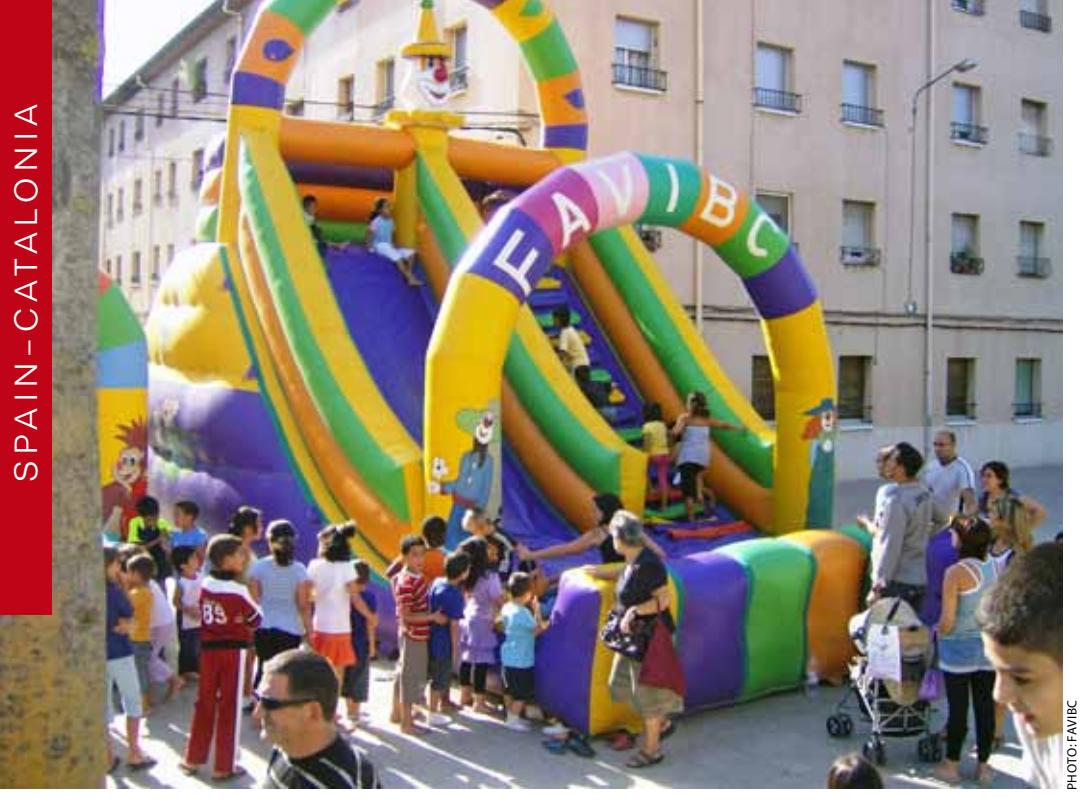
FAVIBC event in Vic, north of Barcelona.