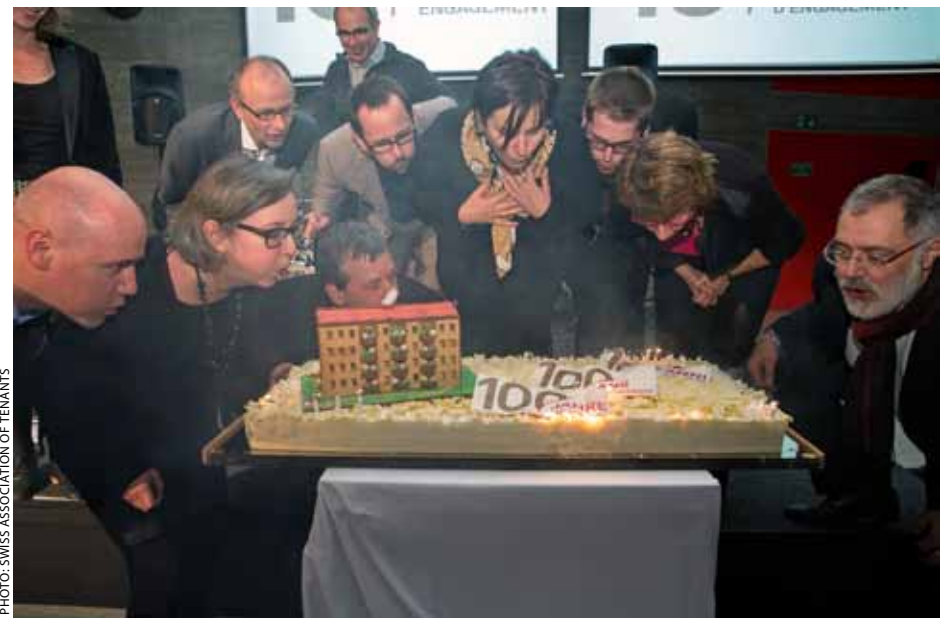
Board members of the Swiss Association of Tenants celebrating 100 years of tenant protection.