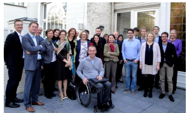
The participants in the conference at Vienna House Brussels

High-level experts from European housing sector met November 13 at the Vienna House Brussels to discuss the future challenges of social housing in Europe . The event was co-organised by the Brussels offices of the International Union of Tenants and of the City of Vienna. 6 It gathered experts from the municipal, social and cooperative as well as private housing sector, cities and regions and their associations as well as representatives from the European Commission, the Council, the European Investment Bank and other financial institutions.