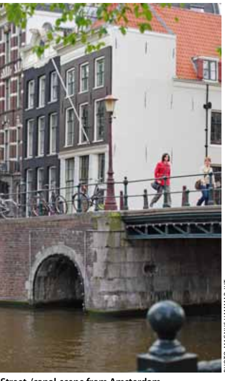
Street-/canal-scene from Amsterdam.

The Committee published, in October this year, a critical report named 'A long way from home. About the report, the Committee's own website writes: "Too ambitious or malicious housing association directors have