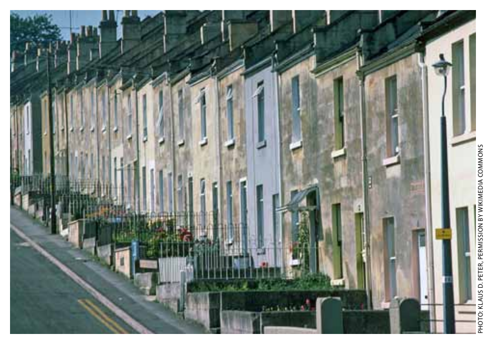
Terraced houses, Brooklyn Rd. in Bath.