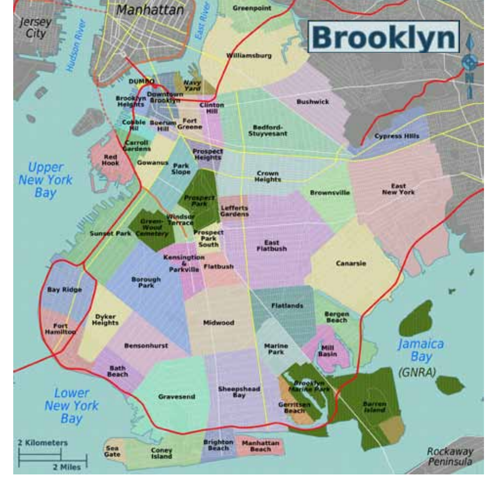
Brooklyn is the most populous of New York City's five boroughs, with about 2.6 million people. Crown Heights is a neighborhood in central Brooklyn.