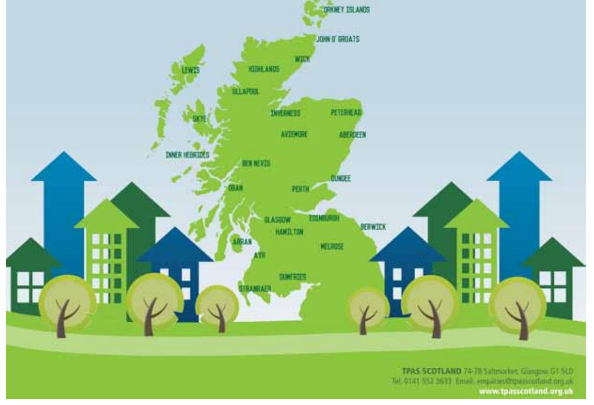
TPAS typically works with tenant's organisations, housing associations and local authorities.