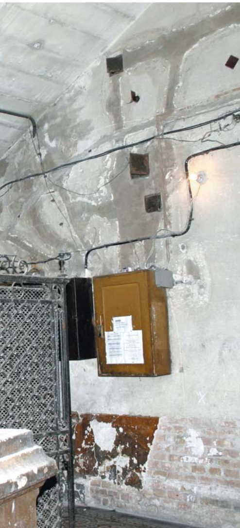
Entrance and the old original lift at Andrásy Street No 21