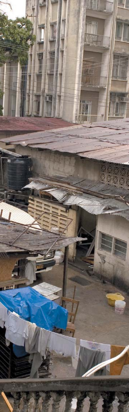
Formal and informal housing in Dar es Salaam.