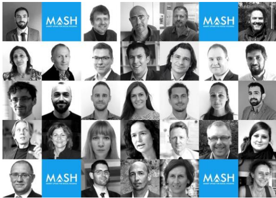
The MASH team in place

Affordability, especially for low income tenants, is a key objective of the proposal. The task is not easy, but the consortium members are very motivated. Housing Europe is a key partner in the project. If the proposal is accepted by the European Commission, the IUT will mobilize its network of national and regional associations to voice tenants' concerns and expectations with regard to deep renovation.