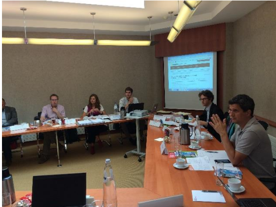
European responsible housing awards jury meeting at German-speaking community rep. in Brussels

those who provide more than a roof over people's head. The selected practices answer in different ways today's challenges like demographic change, urban sprawl, immigration, the energy transitions and residents' participation.