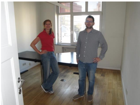
IUT Brussels staff's leaving the old office at Rue du Luxembourg 23

The housewarming party will take place in the afternoon of November 23 , following the European Responsible Housing Awards ceremony 2016. You are cordially invited!