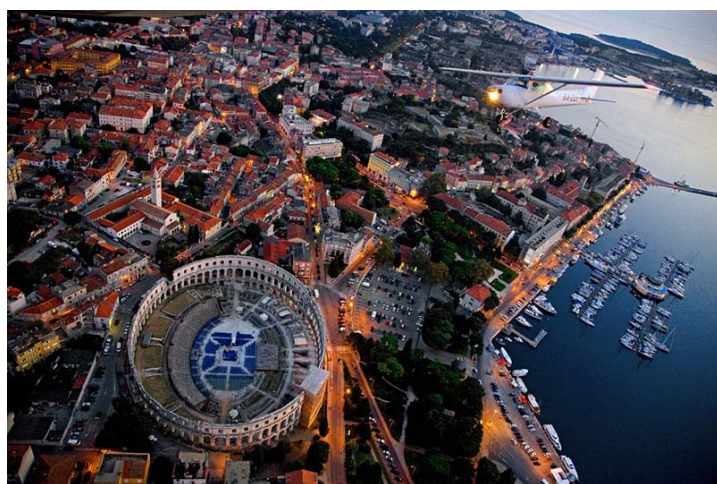
City of Pula (Author: Davor Struhar) 148

Renting on private market is in Croatian coastal area especially problematic. This is due to the fact that these regions (Istra and Dalmacija) are traditionally very touristic. Since no legal limitations on the period for which the tenancy contract can be concluded, exists, private persons rent the apartments solely for the non-touristic period (which depends on the region but it can be as long as from May to October). These enables the landlords to rent in two ways: to private persons from 1 st of October to 1 st of May; and then to tourists in the touristic period. This situation however leads to a situation where the private tenancy market, especially for families, becomes non-existent. (See more in Part 2 Restrictions on choice of tenant - antidiscrimination issues).