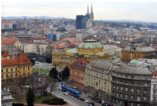
Zagreb city centre 2

At the beginning of the twentieth century, the authorities in Zagreb began to deal with the problems of the housing situation in the city caused by the fast growth of its population. From 1918 to 1941, significant changes in the housing standard are recorded and housing policy became a recognizable part of the social policy. Some forms of protected tenants existed; social housing was built by the civil organizations and co-operatives, with the city of Zagreb acting as a partner to housing co-operatives in extensive projects of building settlements with family houses. Significant increase observed in construction of housing unit blocks at the end of 1920s was connected with cheap (affordable) housing loans. 1 At the end of this period, especially during the World War II confiscation of housing was practiced.