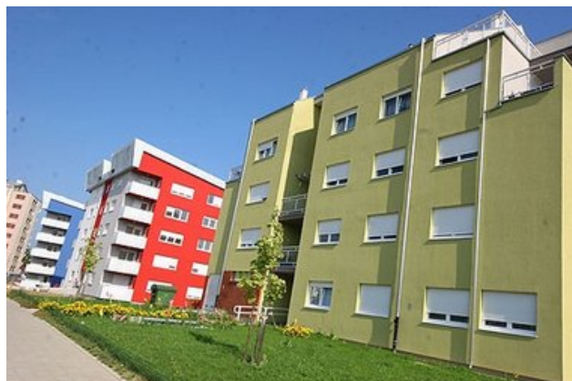
POS Programme apartment buildings in Split 124

This programme was introduced in 2001 with the Publicly Subsidized Residential Construction Act. Shortly, it is described as 'a state subsidized housing construction ... a centralised, top down programme for helping families that are buying their first housing unit'. 125