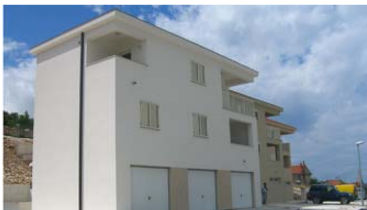
Nerežišća, Island of Brač; POS Rent-to-buy scheme apartments 135

A new POS Programme Rent-to-buy scheme has been introduced on 16 th of May 2013. The offer includes unsold apartments from the POS Programme. The apartments are on the locations: Zagreb, Novi Jelkovec-Sesvete, Ogulin, Bjelovar and Nerežišća on island of Brač. Due to large demand, the application process was already concluded before 15 th of August 2013. The procedure is made in accordance with the rule “first come first served”, but the tenants (and their family members living in the same household) cannot own an appropriate apartment or a house in the same area, have to be Croatian citizens and must exceed the census of 30% BDP per a family member 134 .