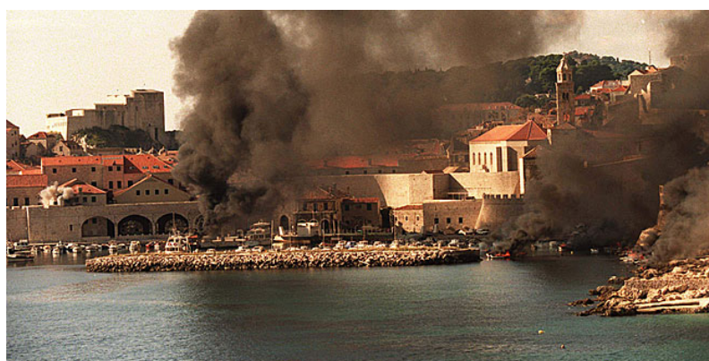
Dubrovnik UNESCO protected Old city during the war (Author: Jasmina Mrvaljević) 84

The war in Croatia 1991-1995 caused numerous problems, quite some related to housing. Influx of refugees and displaced persons, demolition of housing units and infrastructure were just some of them.