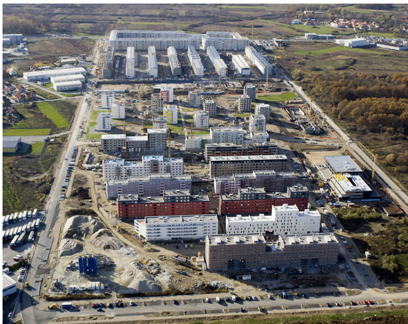
The biggest POS Programme location Novi Jelkovec, Zagreb 152

In public information on the poor quality of newly built housing units within the POS programme can be often heard. The quality of construction is also questionable in newly built housing units on private housing market. This is often the consequence of insatiable desire for extra profit of private housing constructors. (EU Building directive did in these past cases not apply due to the fact, that Croatia joined the EU only on 1 st of July 2013)