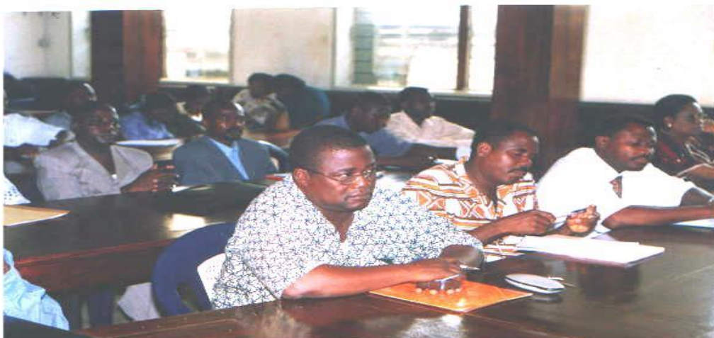
Participants to the conference of ANCE/Togo during the WHD 2003 in Kara, Togo