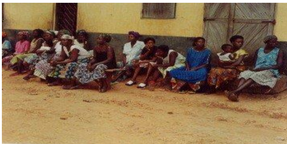
Discussion about the right for housing and tenants rights with women groups, Kpalime, in Togo, 2004