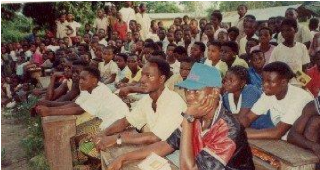
Participants attending the meeting of ANCE/Togo during the WHD 2003 in Kara, Togo