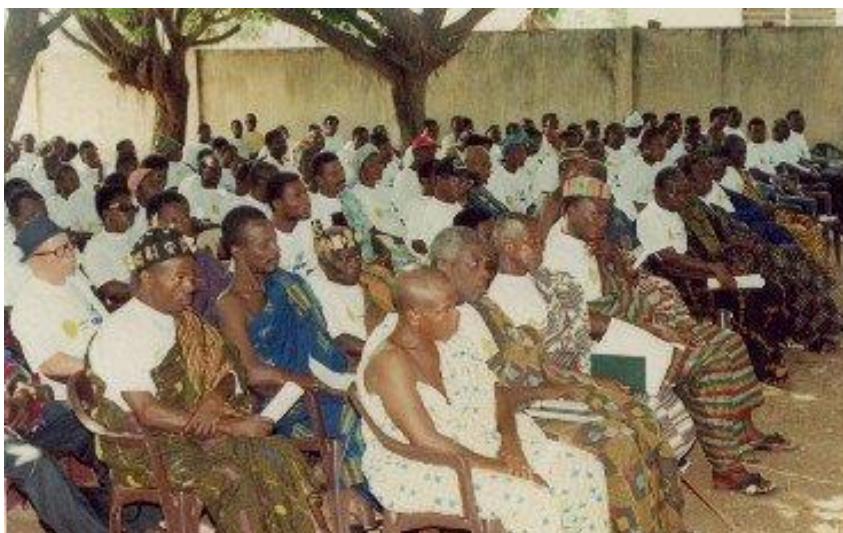
ANCE/TOGO : Public meeting in Fléau Jardin, Lome-Togo, Oct.1st, 2003