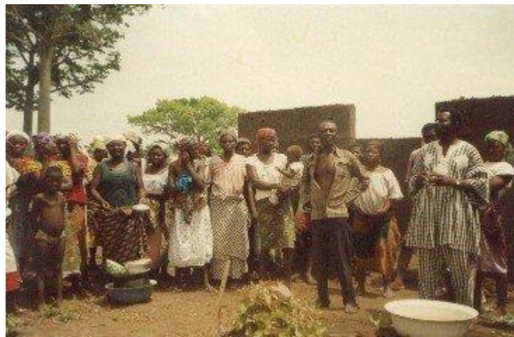
Discussion about the right for housing topic with a local community in Blitta, in Togo, 2004

Many other activities were organized during the WHD 2004 with communities in Tsevie, in Davie, Blitta and Kpalime (South of Togo). Please, see pictures.