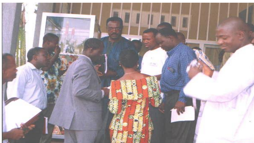
The WHD 2004 in Lome, Togo Free discussion before the presentation of the declaration of Lome to the press,

The World Habitat Day launch provided an opportunity to the NGO ANCE/Togo to invite the Togolese authorities to implement the "Cities without Slums" programme which will enable Togo, to be a slum-free nation by 2010. Representatives of different stakeholders, including a woman, living in a slum of Be-Kpota in Lome, signed the "Lome Declaration" that translates the commitment of all parties to the principles of the that campaign.