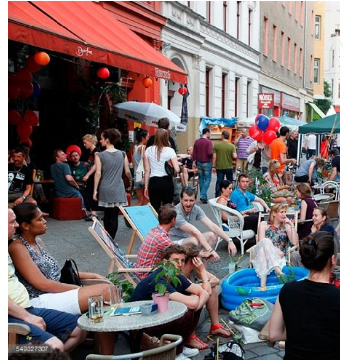
Berlin, Kreuzberg, street festival