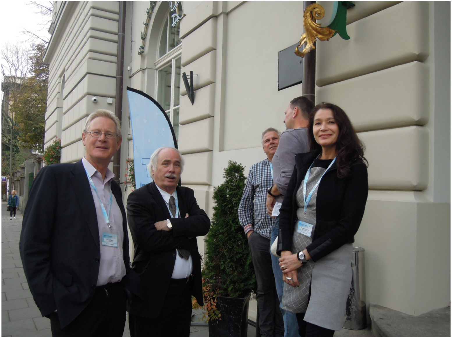
Dutch delegation, the Nederlandse woonbond