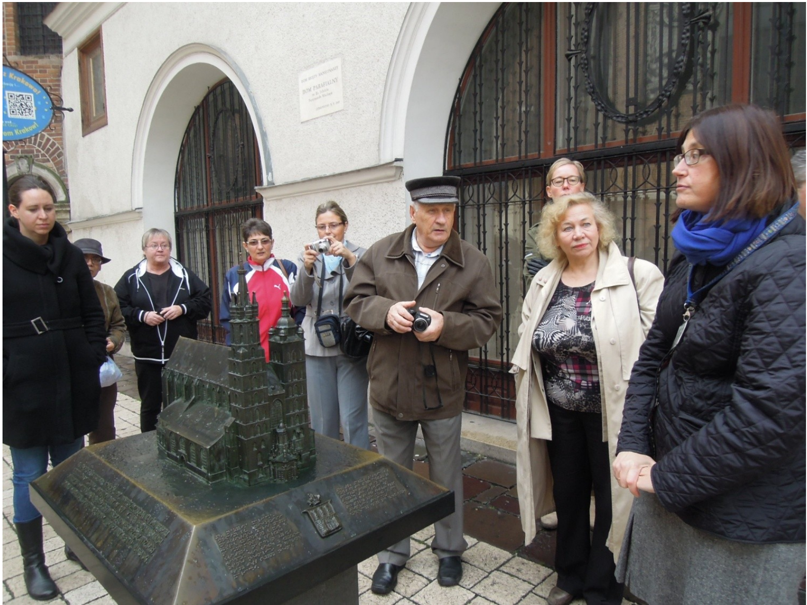
Study visit to Nowa Huta