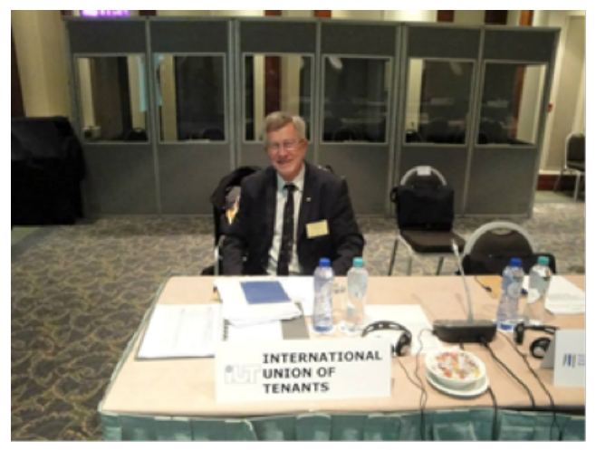
IUT President Sven Bergenstråhle at EU housing ministers meeting, 10 December 2013, Brussels

On 10 December 2013, IUT President Sven Bergenstråhle gave a passionate speech at the informal meeting of the EU housing ministers in Brussels. The need for more tenure neutrality in national housing policies and for a larger rental housing sector were the main messages conveyed to the audience. The ministers were impressed by the positive correlation between GDP and availability of rental dwellings. They ministers produced a communique in which they agreed on the need to develop a strategy to fight housing exclusion and to support new financing methods for affordable housing. In this respect, they emphasized the importance of the European Investment Bank to meet the need for affordable housing in the EU<sup>31</sup>.