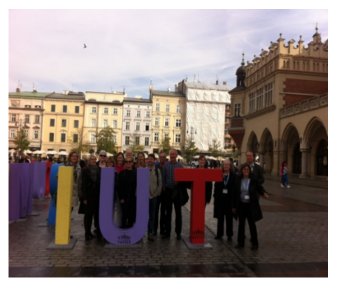
IUT members in Krakow city center

23-27 October 2013, the Brussels delegation contributed to the IUT Congress in Krakow through two main initiatives: the launch of the "EU guide for tenants unions", and the political coordination of the "Tenants milestones for the elections of the European Parliament".