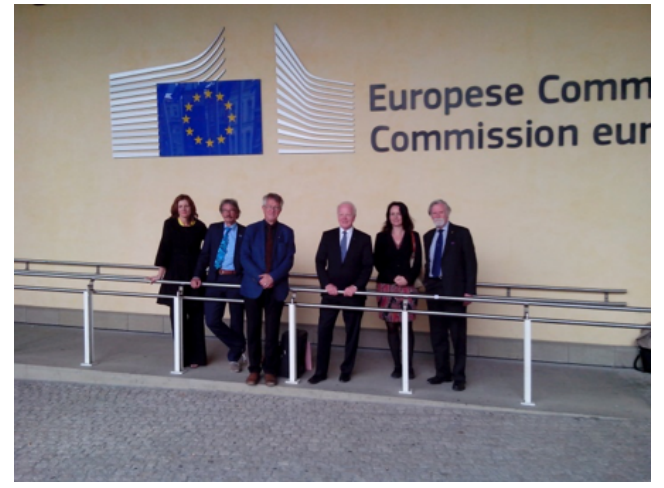
IUT and Housing Europe delegations in front of Berlaymont building

Other meetings were organized with the European Parliament in 2015, as part of the Housing Reference working group. Together with its allies in Brussels, the IUT is currently promoting a more "social Semester" and will contribute to the definition of a European "social pillar".