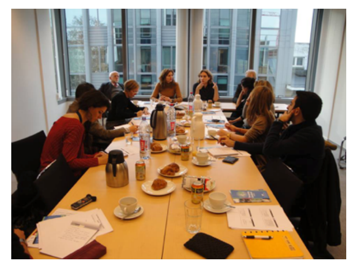
Joint press conference with PAH and DMB, 8 December 2013, Brussels

with Housing Europe on the theme of evictions a few days after the conference with PAH<sup>28</sup>.