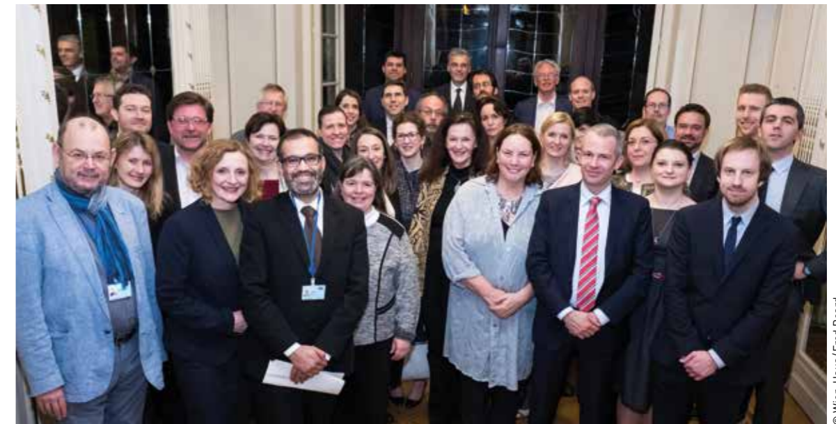
Housing Partnership of the Urban Agenda