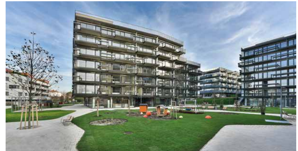
1230 Vienna, In der Wiesen Süd, lot 7

wohnfond_wien's market position is not due to any pre-emption rights (which do not exist) or large land holdings (which do exist). Rather, it results from the cost rent policy and subsidy conditions, which tie rents to development costs. wohnfonds_wien tries to minimise these costs, especially the price of land, in order to reduce rents and maintain housing quality.