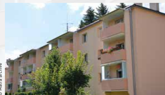
Renovated and modernised building

The Ministry of Transport and Construction is responsible for formulating the state housing policy, the preparation of the legal and financial framework and instruments for housing development and stakeholder co-ordination. Since 1995, every five years, the government has adopted an updated state housing policy concept. For years, one priority has been the renovation and modernisation of the existing housing stock, including energy efficiency measures. This remains a challenge, since more than 90% of the housing stock in Slovakia is owner-occupied.