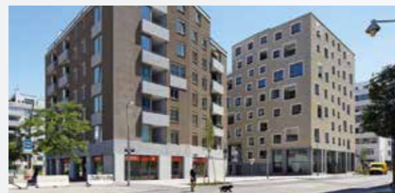
1020 Vienna, Nordbahnhof II, lot 2b

wohnfonds_wien co-ordinates site planning and development activities with the City of Vienna, especially concerning the timing of infrastructure provision. The precise release of these sites is dependent on the provision of technical and social infrastructure in each development area, such as roads, schools and kindergartens, which are commissioned or completed by the city government.