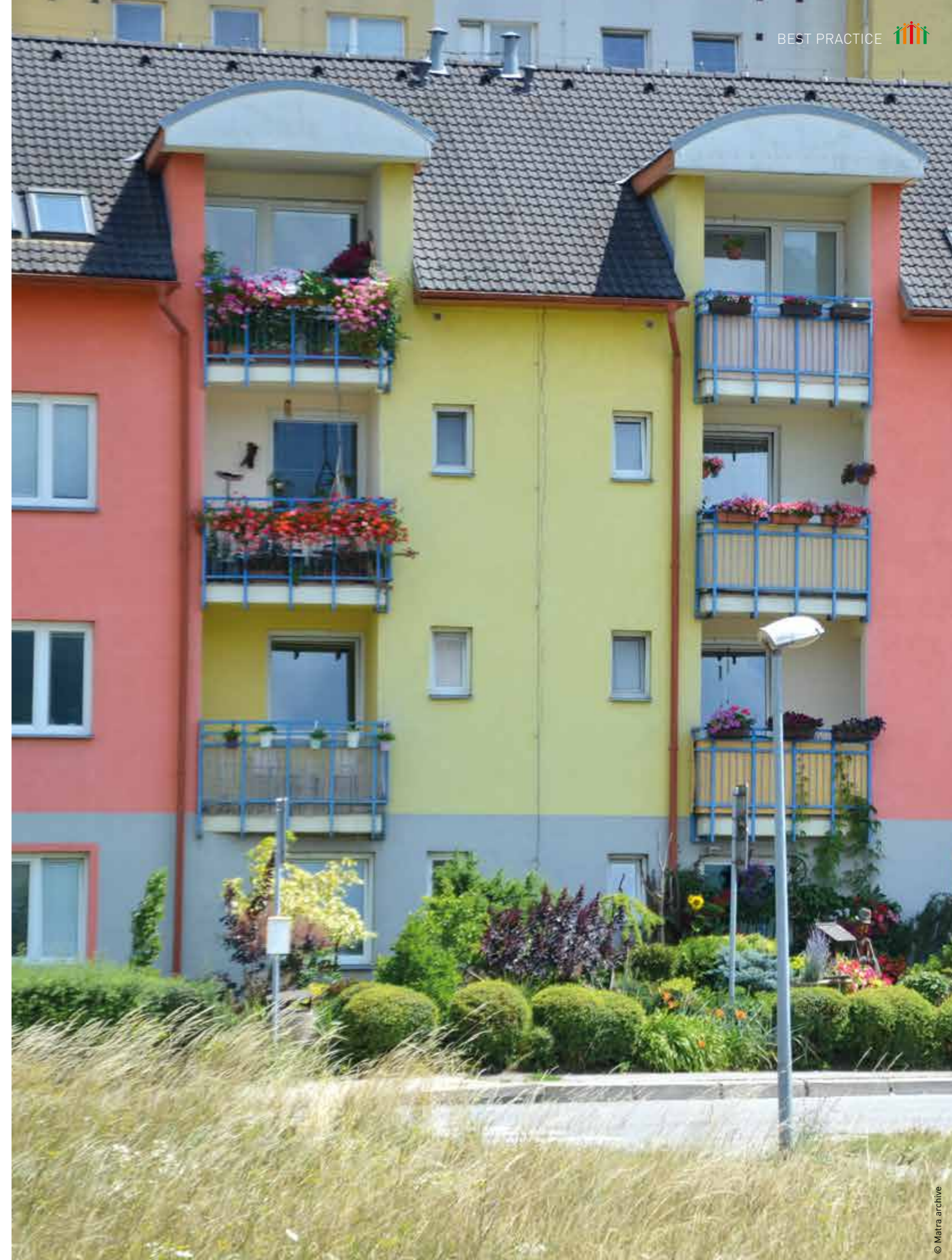
Renovated and modernised building