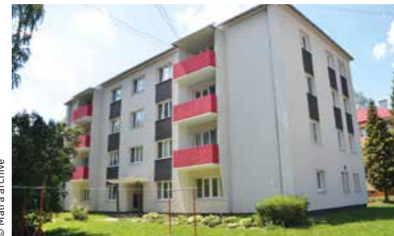
Another building of the project after renovation