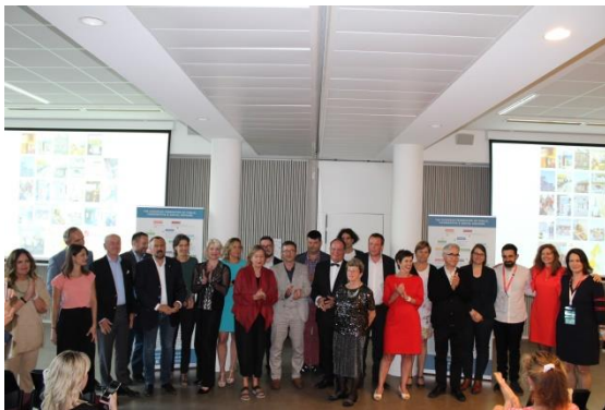
The ERHIN awards winners, together with the jury and the ERHIN-team

Power to the people, Torino (Italy): https://www.atc.torino.it/articolo/1979