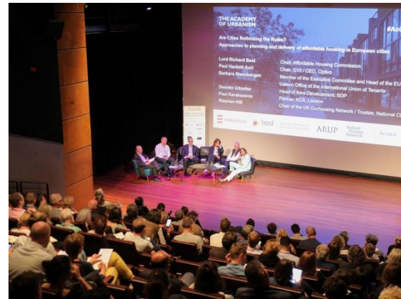
Debate with international urban planners in the former Philips "LAB-C", Eindhoven