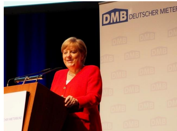
Chancellor Dr. Angela Merkel at Mietertag

welfare, have to contribute. The chancellor also announced regulative law measures against exorbitant rents and an initiative to mobilise more building ground.