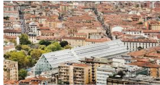
Fondazione Feltrinelli Headquarters Milano, a “laical cathedral”

renewal of quarters and planning and modernisation of buildings- as the main stakeholders, tenants make cities, but in most cases they don’t play a significant role in planning processes. Therefore it is necessary to find new democratic forms of co-management and co-creation, as pointed out in the EU action plan.