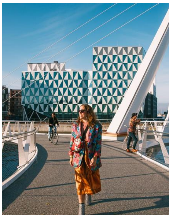
Urban Future Conference Helsingborg, June 1-3, 2022

Urban Future is the largest event for urban change makers in Europe. But how to become a change maker? This is the question that has been in the driver's seat for the Urban Future right from the start.