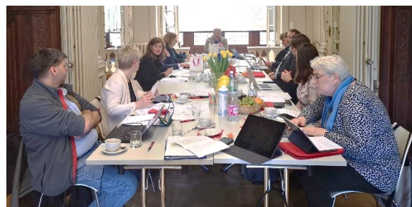
ERHA Jury meeting April 7th at the Vienna House, Brussels