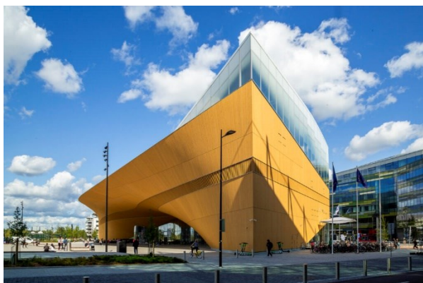
Helsinki Oodi Central Library, location of the ERHA Ceremony

On the 16 th of June 2022 the fourth edition of the European Responsible Housing Awards Ceremony took place in Helsinki as a main event of the International Social Housing Festival. 4