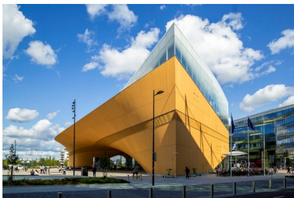
Helsinki Oodi Central Library, location of the ERHA Ceremony

On the 16 th of June 2022 the fourth edition of the European Responsible Housing Awards Ceremony took place in Helsinki as a main event of the International Social Housing Festival. 4