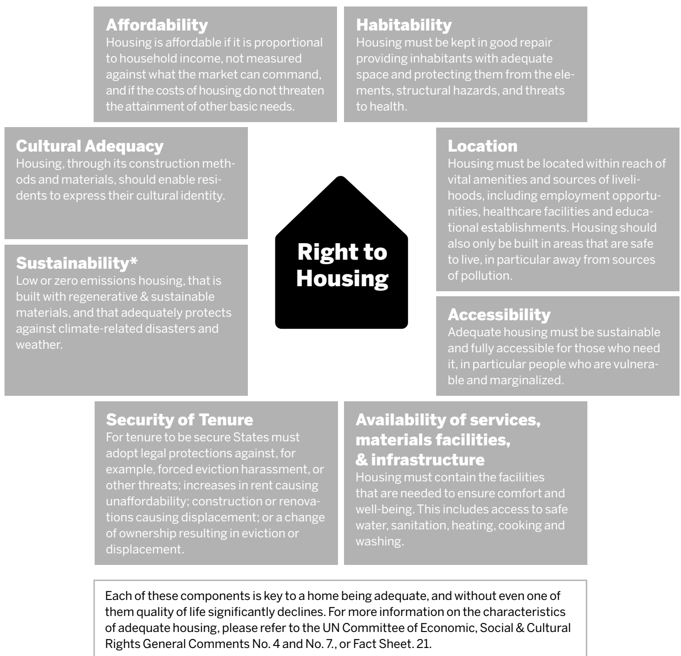
Figure 1. Characteristics of the right to housing

There is an international consensus that housing is a fundamental human right. It is found in the Universal Declaration of Human Rights (1948), in the International Covenant on Economic, Social and Cultural Rights, as well as other human rights treaties ratified by almost all national governments around the world. It is contained within Goal 11 of the Sustainable Development Goals (SDG), in the Paris Agreement, as well as in the New Urban Agenda. For housing to be considered adequate, it must have eight key characteristics, as seen in Figure 1.